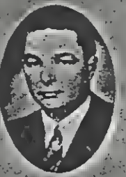
Warren Reidelberger Law - Misc.